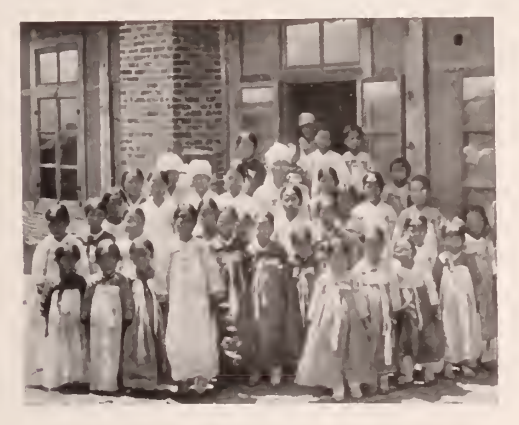
PYENG-YANG GIRLS' SCHOOL.

In their early days, when there were few foreigners in the country, and the object of missionaries was unknown, or at best was but partially known, wrong impressions were